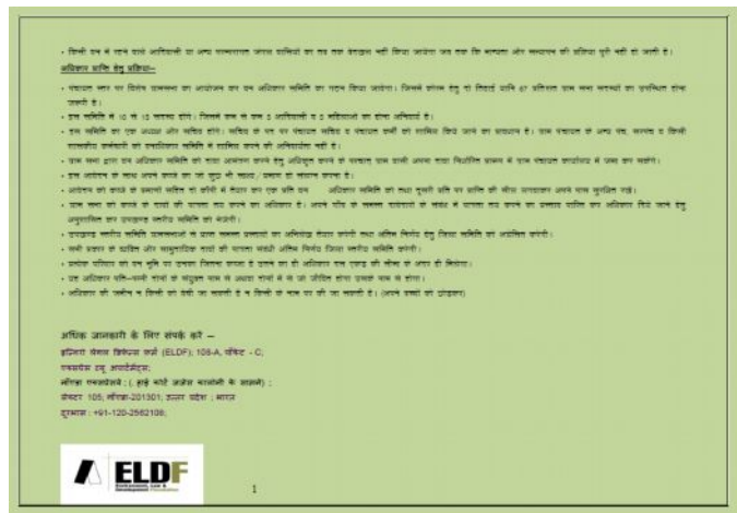
FRA Pamphlet for A2J Project